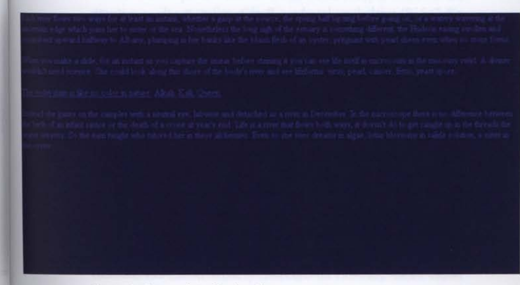
Figure 3. Screen shot, Twelve Blue